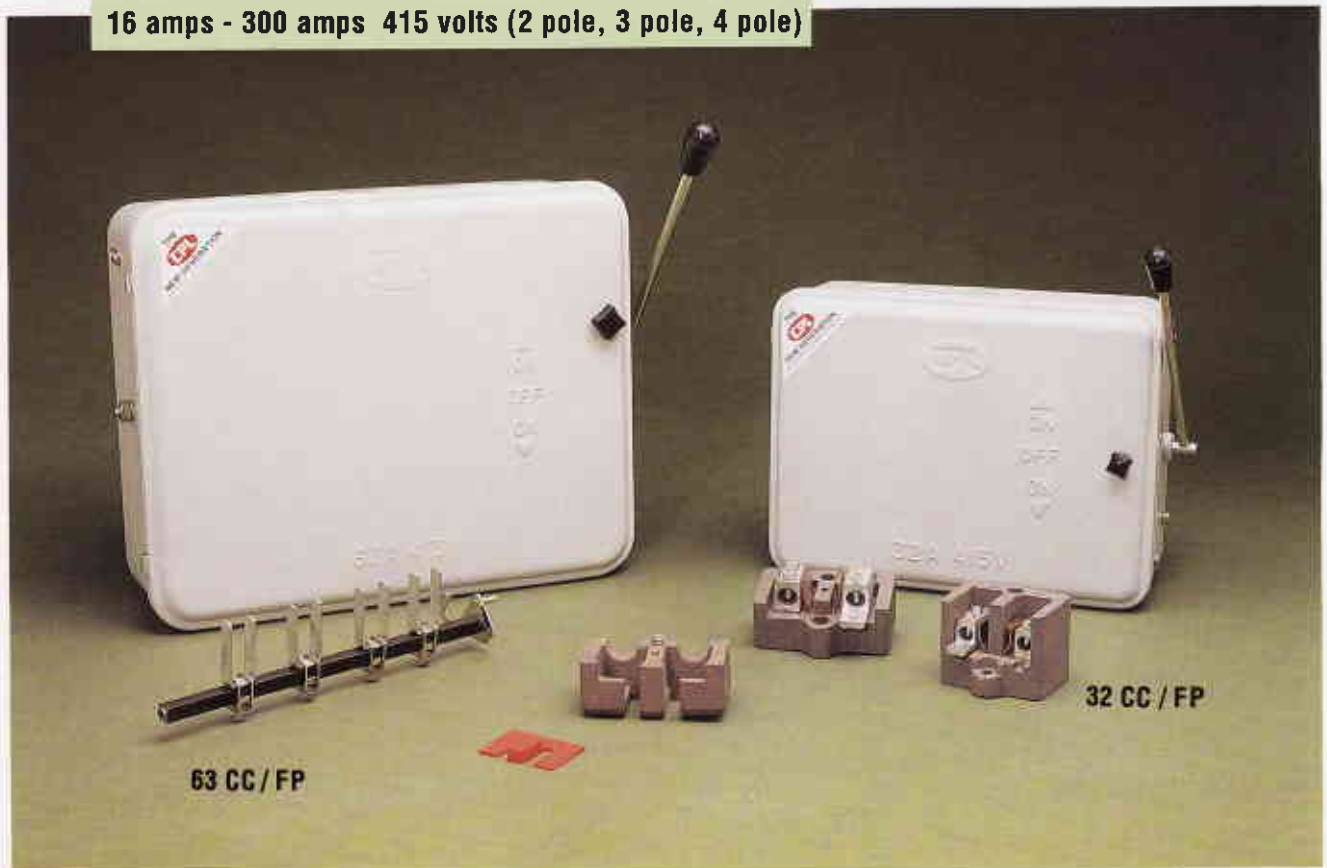
63 CC / FP