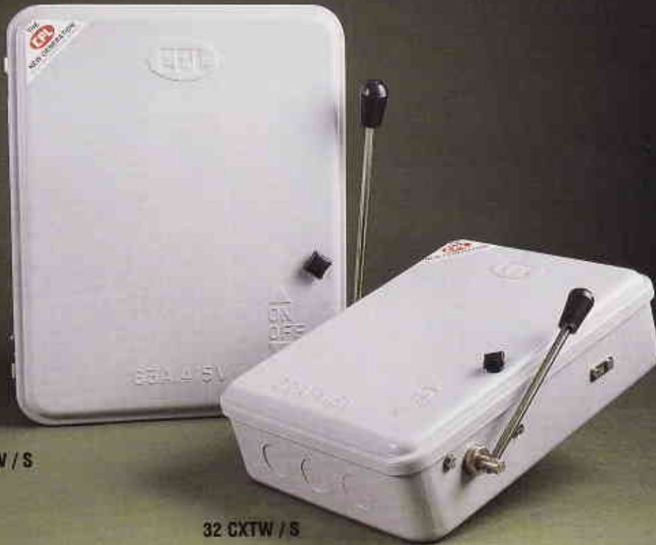
63 CXTW / S