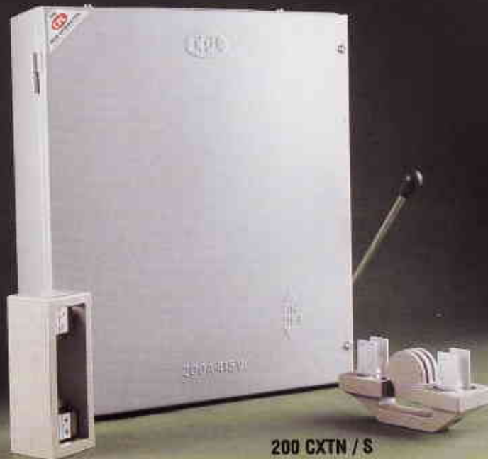
200 CXTN / S